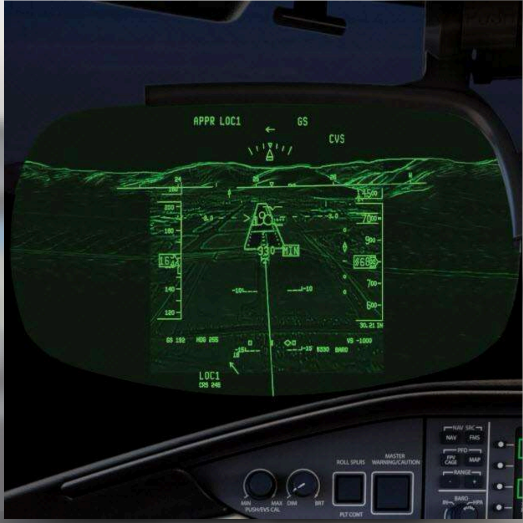
PILOT'S HUD SYSTEM