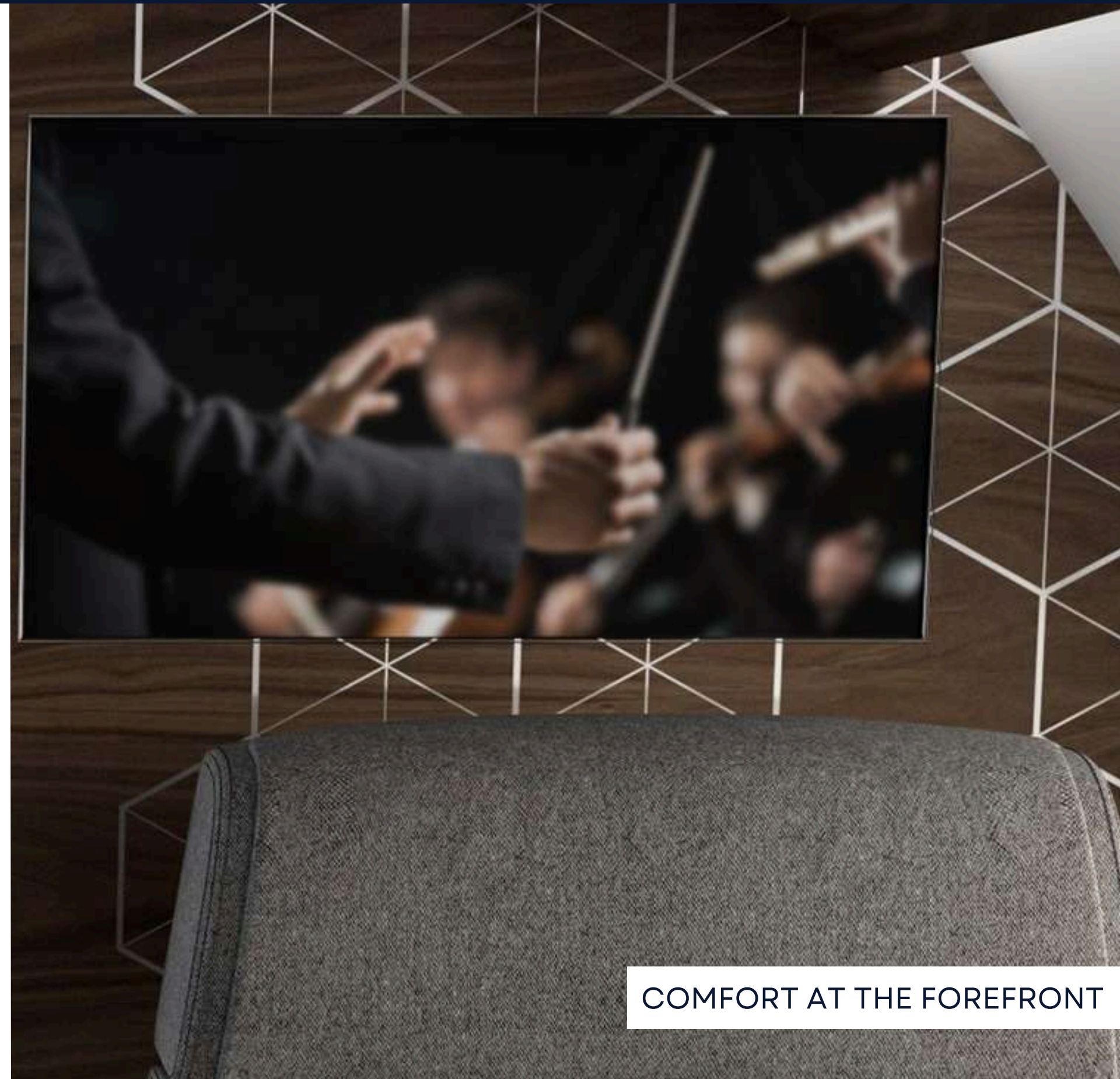
COMFORT AT THE FOREFRONT