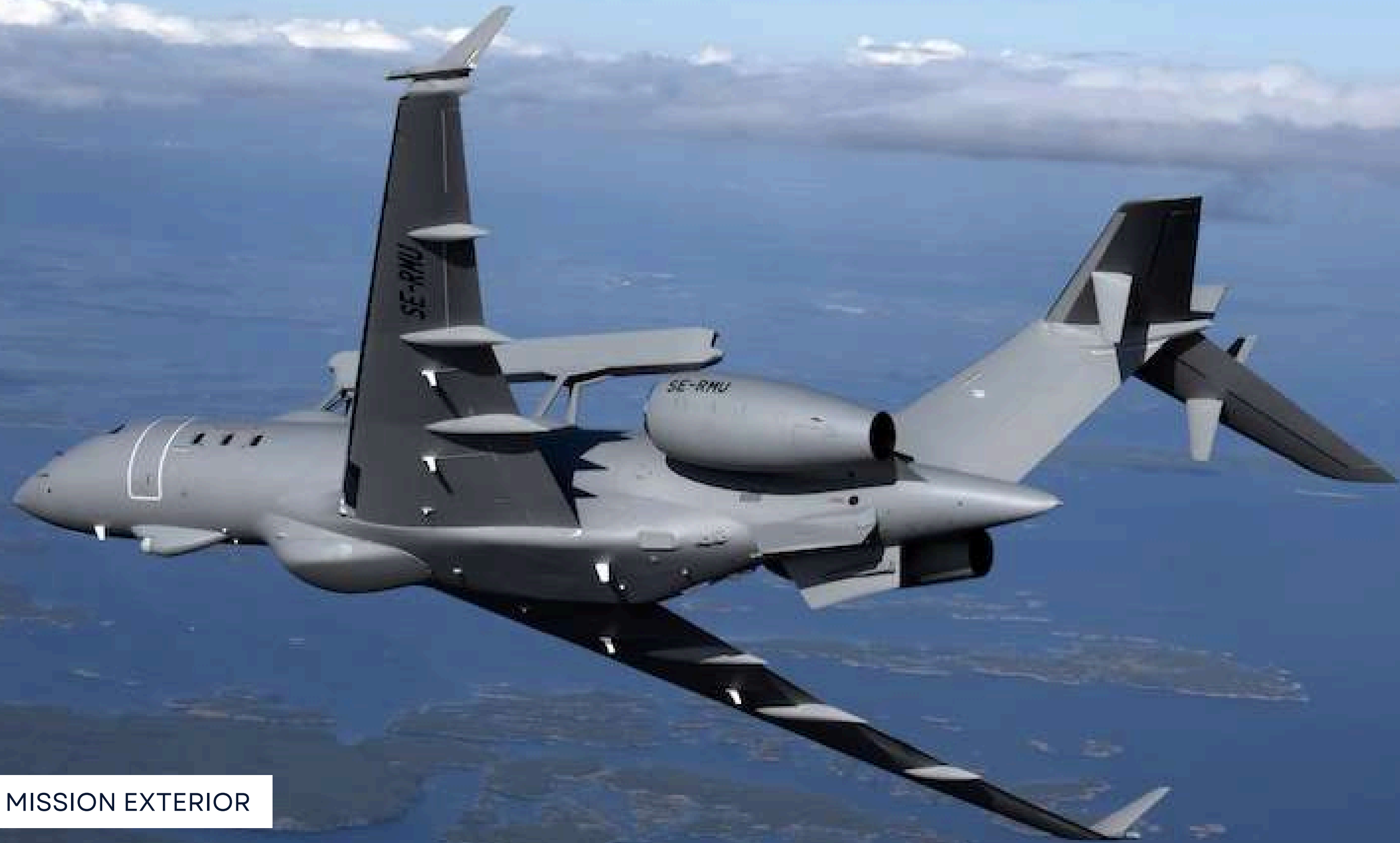
SAMPLE OF SPECIAL MISSION EXTERIOR