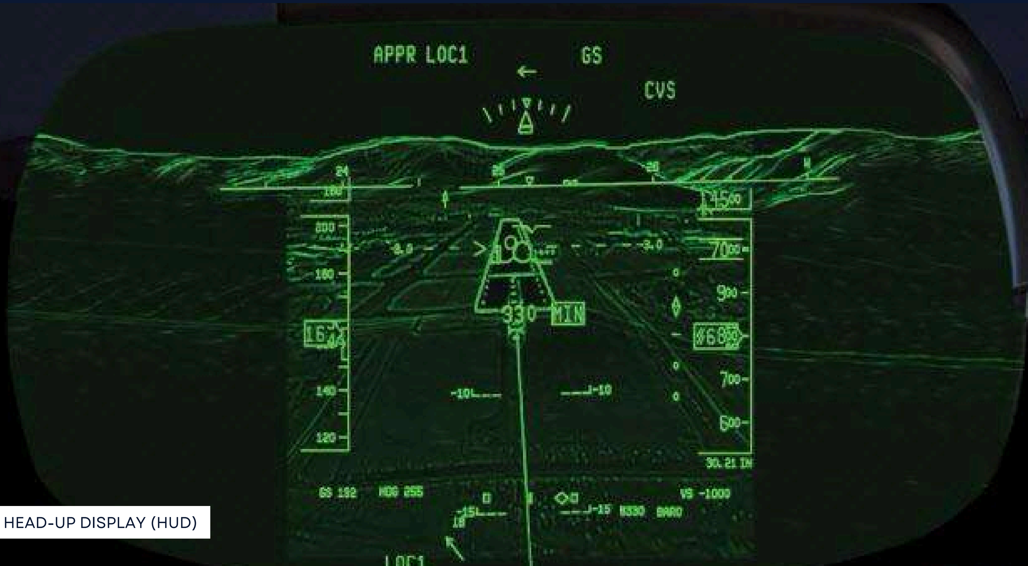
PILOT'S HEAD-UP DISPLAY (HUD)