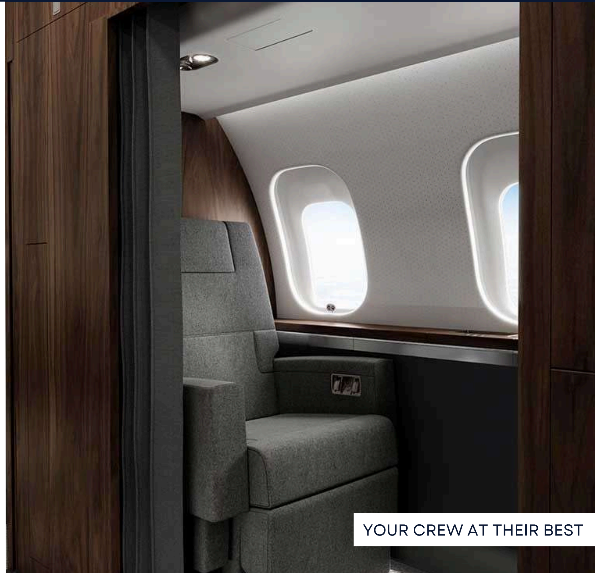
YOUR CREW AT THEIR BEST