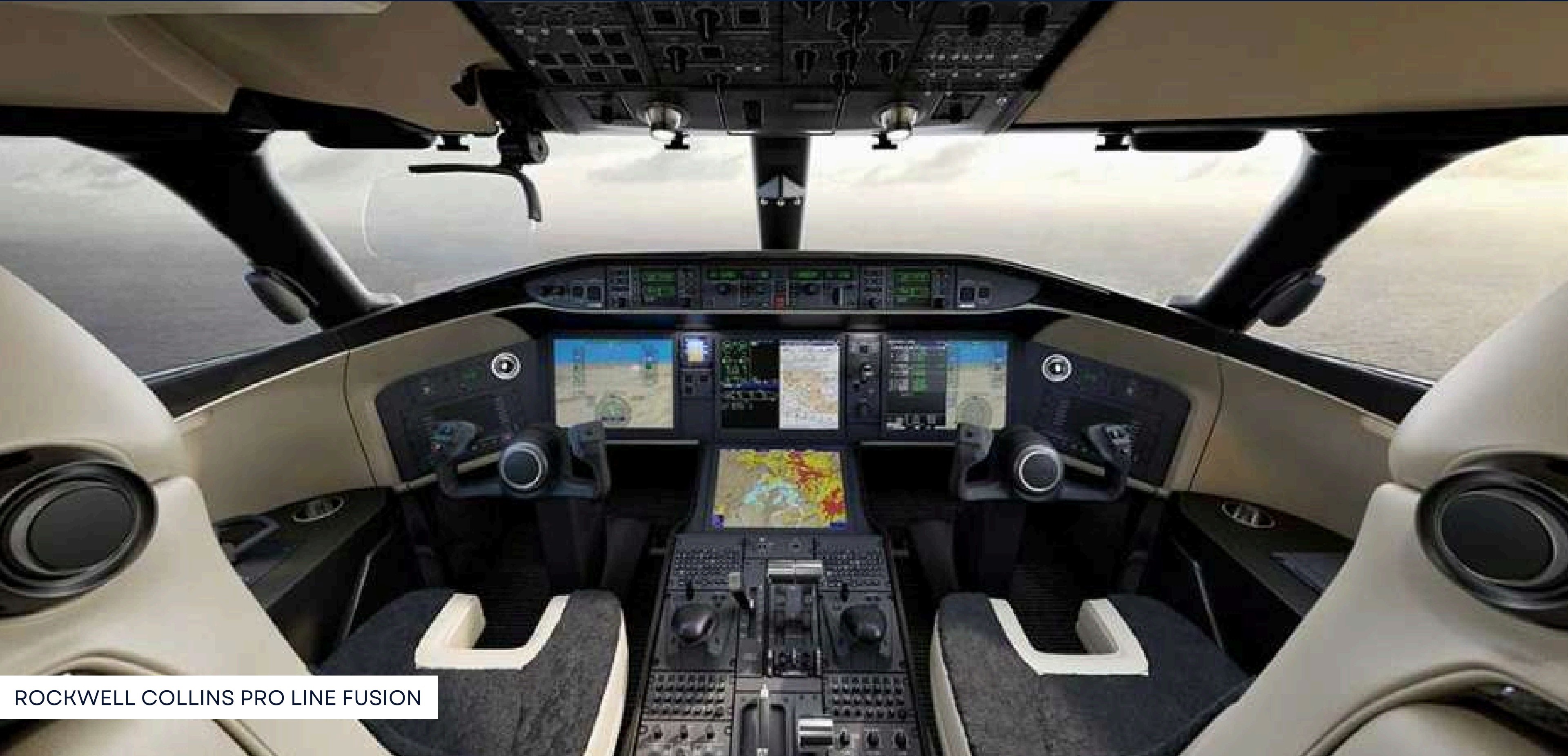
ROCKWELL COLLINS PRO LINE FUSION