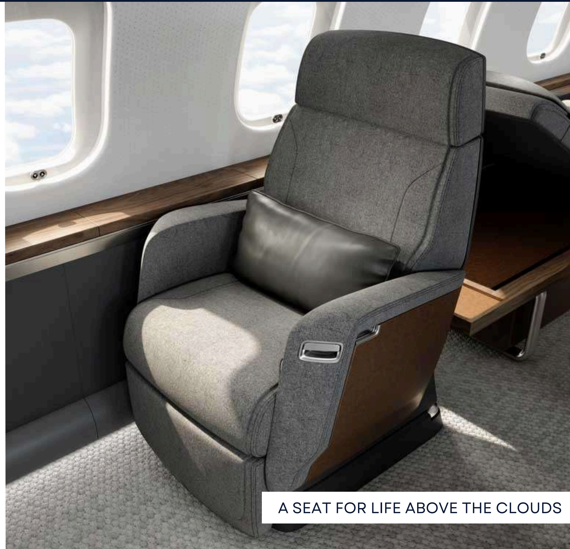
A SEAT FOR LIFE ABOVE THE CLOUDS