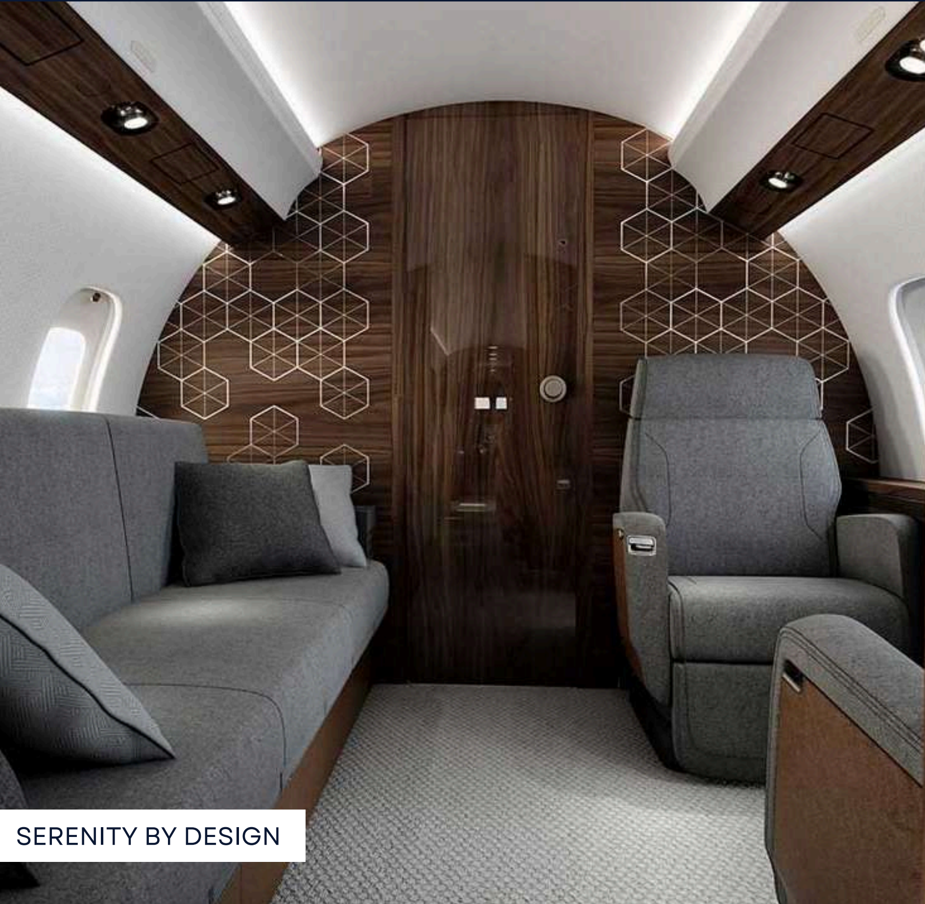
SERENITY BY DESIGN