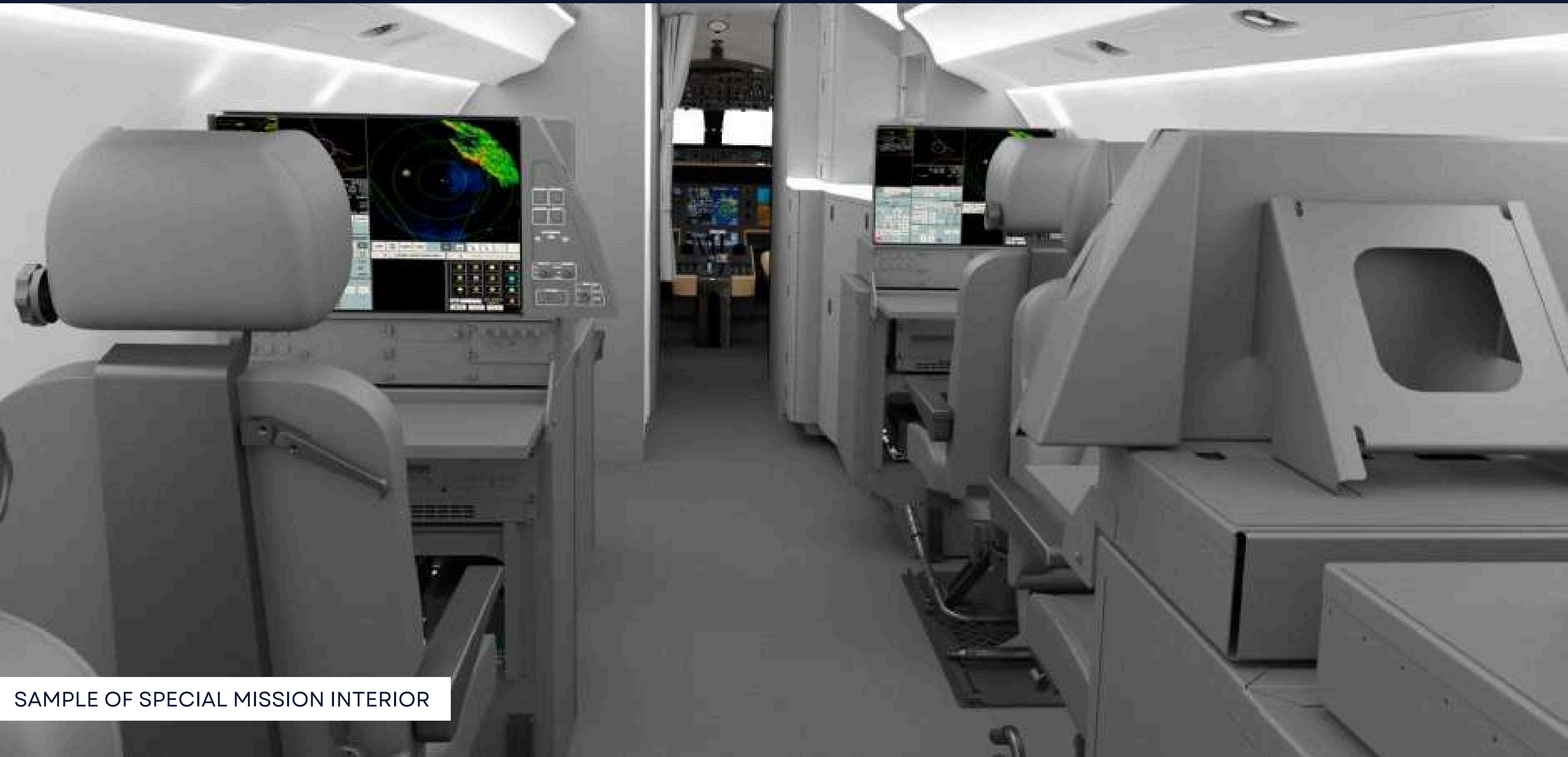
SAMPLE OF SPECIAL MISSION INTERIOR