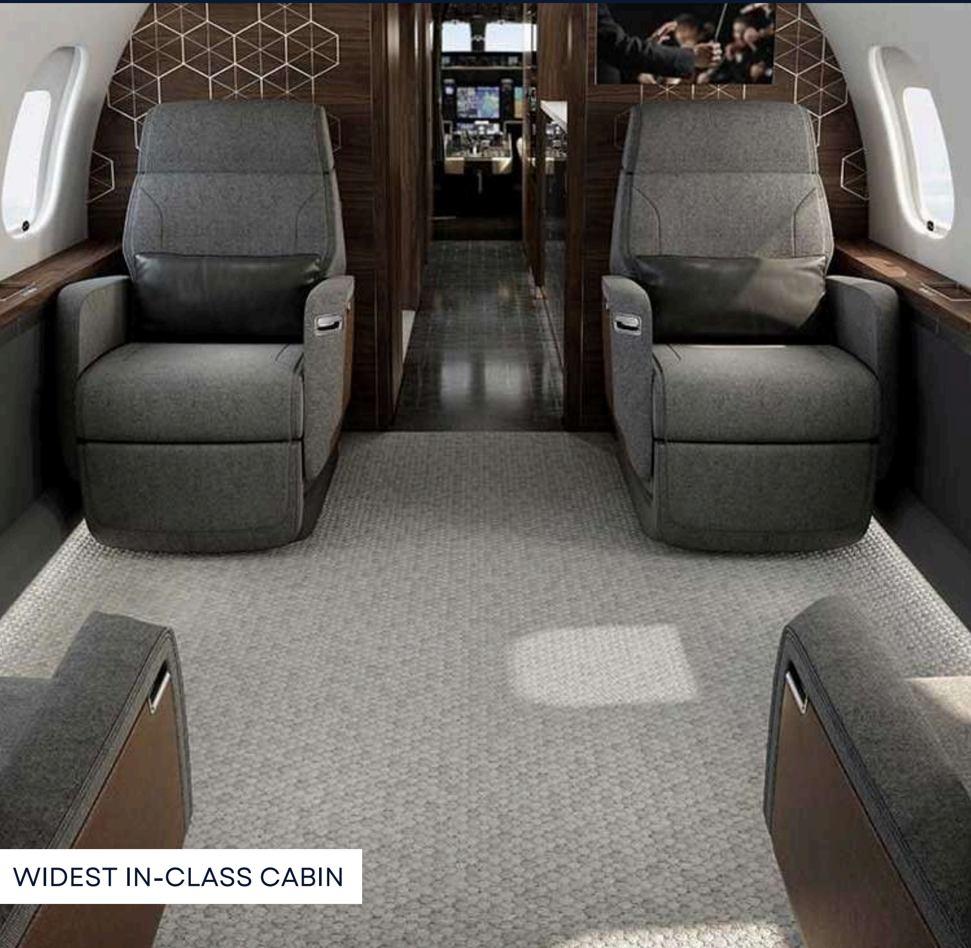
WIDEST IN-CLASS CABIN