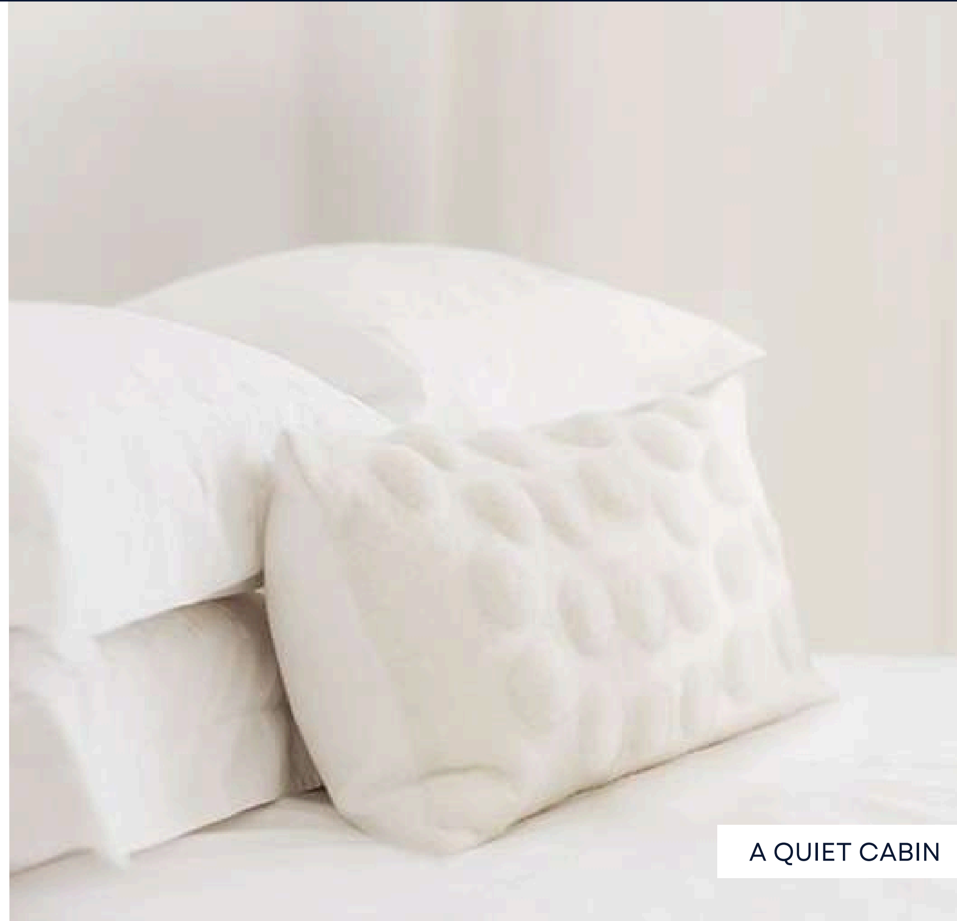
A QUIET CABIN