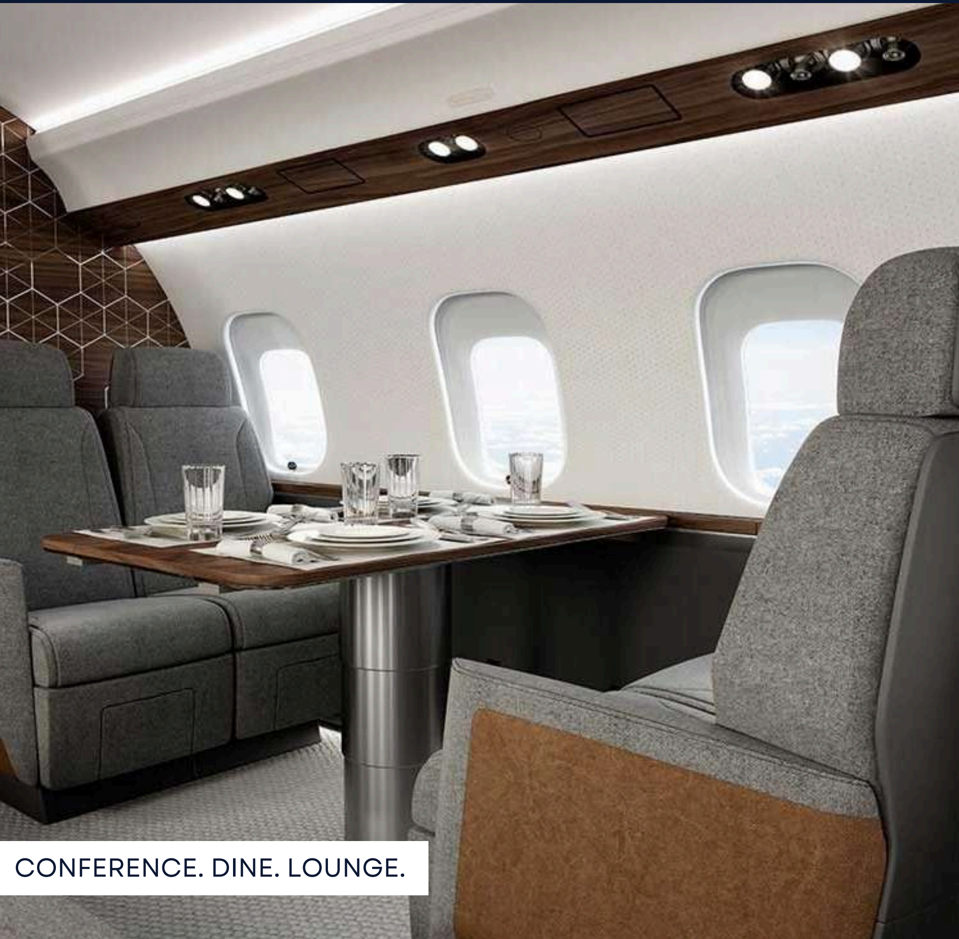
CONFERENCE. DINE. LOUNGE.