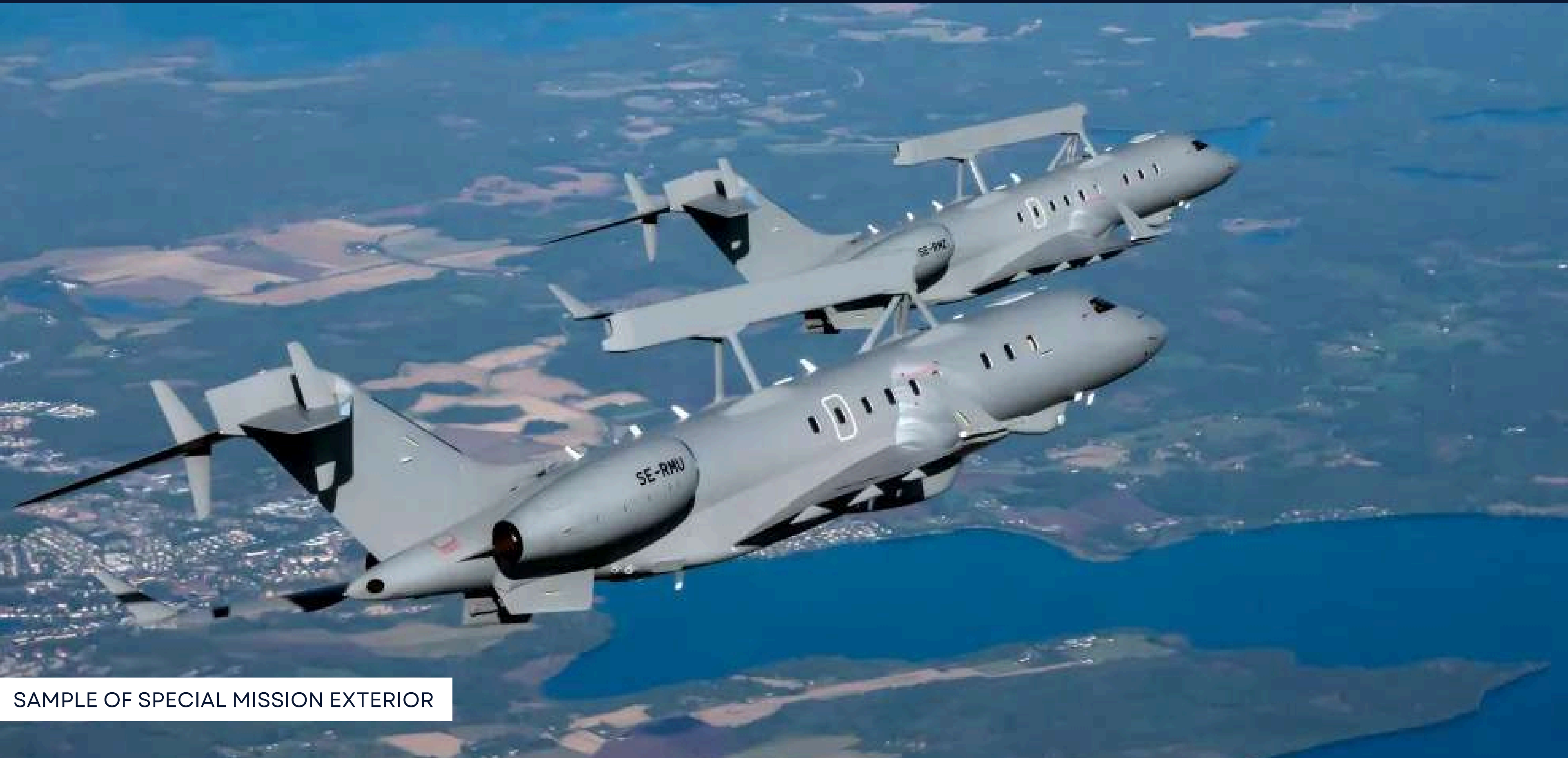
SAMPLE OF SPECIAL MISSION EXTERIOR