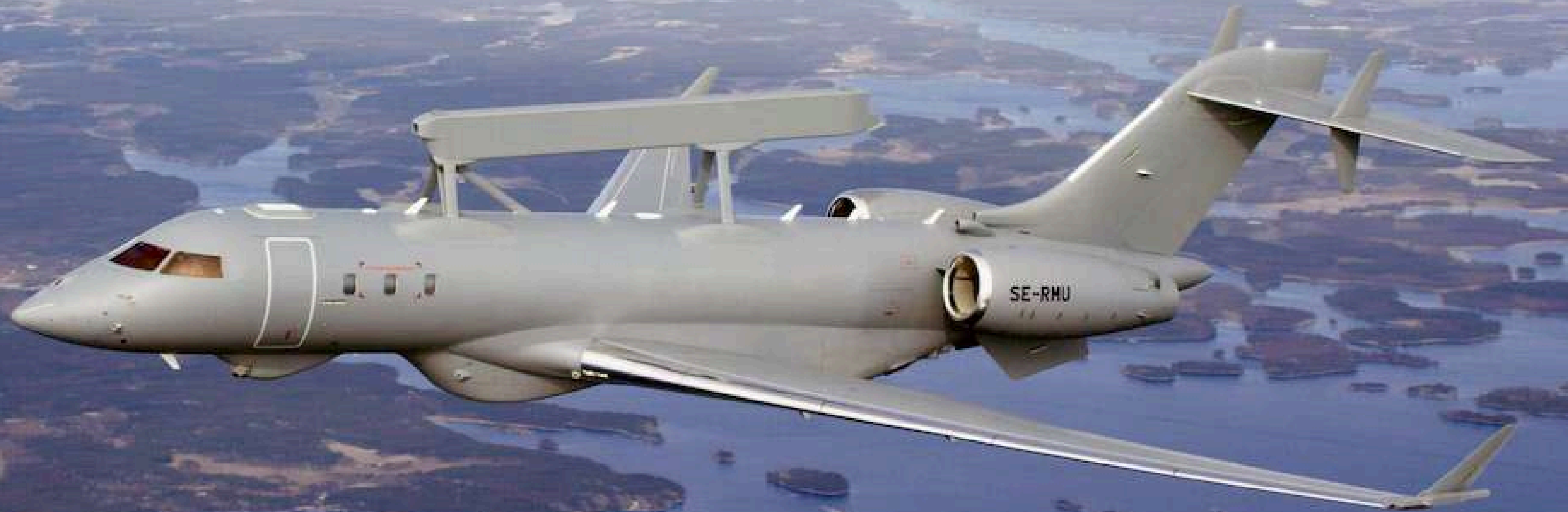
SAMPLE OF SPECIAL MISSION EXTERIOR