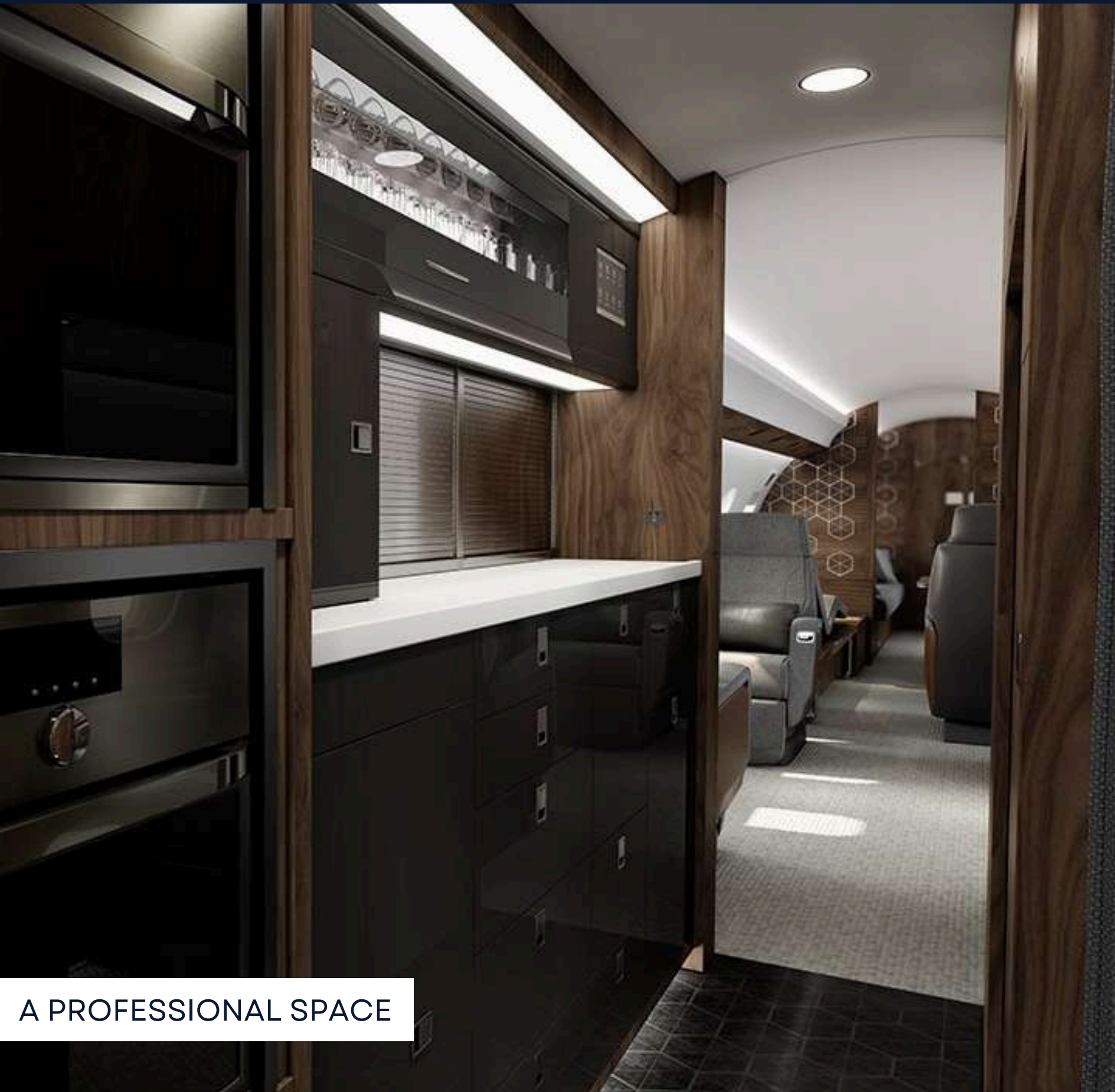
A PROFESSIONAL SPACE