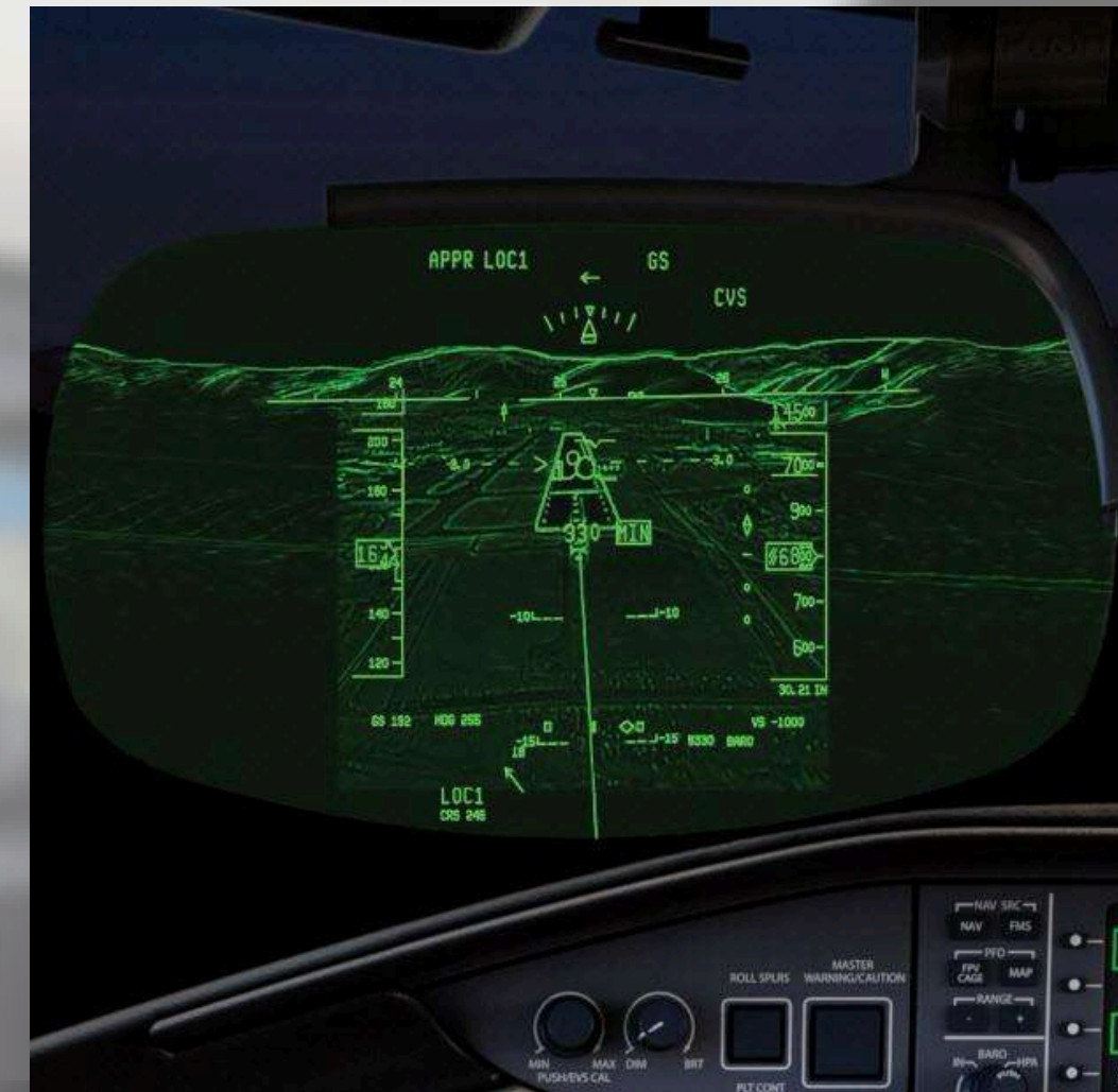
PILOT'S HUD SYSTEM