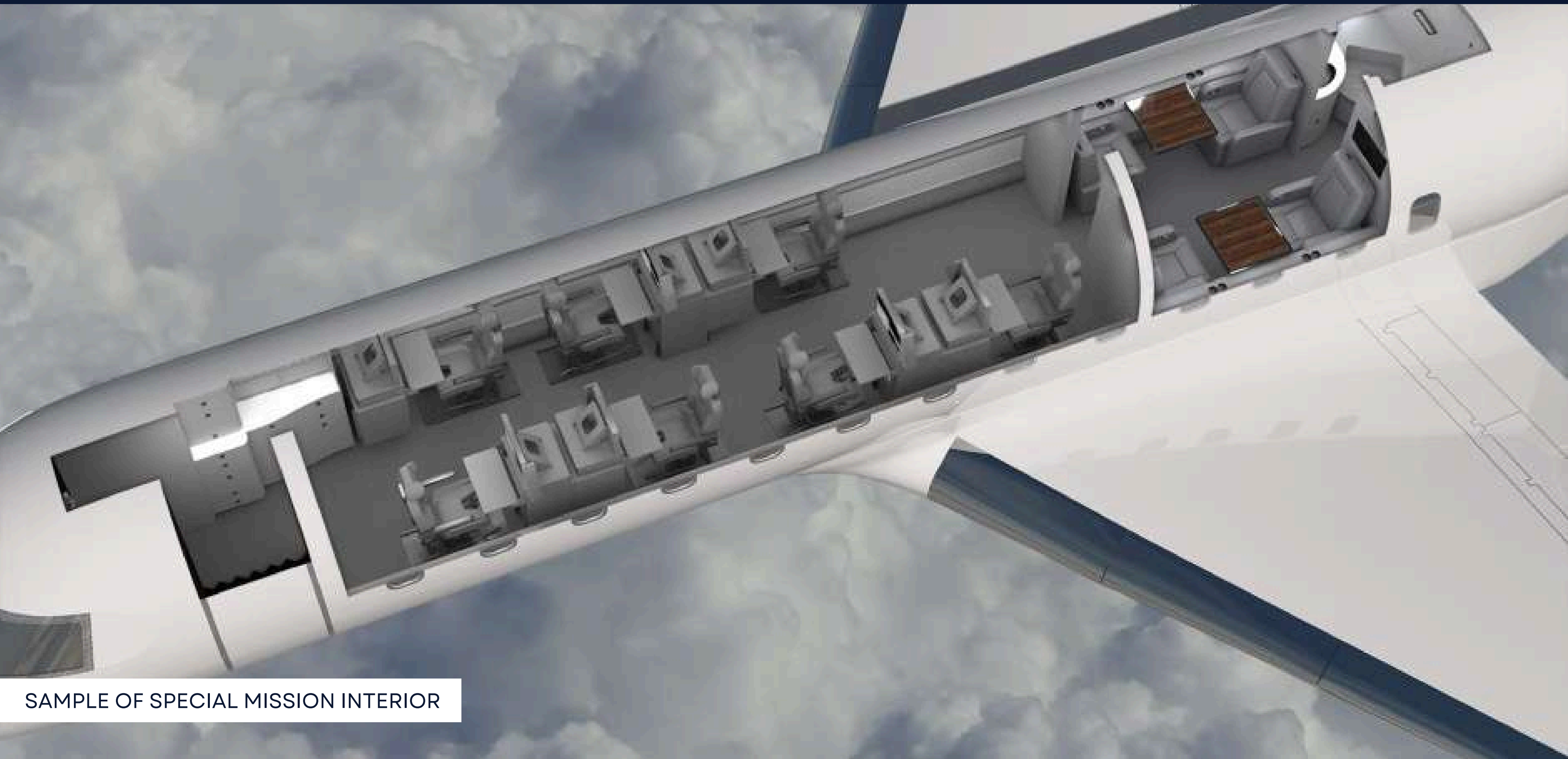
SAMPLE OF SPECIAL MISSION INTERIOR